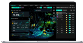
Virtual Loop Setup