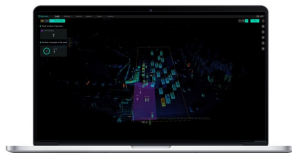
Detection & Classification